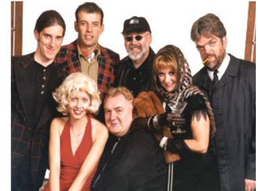
The cast of Rehearsal for Murder will keep you on the edge of your seat wondering "who dun it?"

Tickets are $75 each and are available from the PCRC Office at 56 Royal Road N, the Royal Bank at 140 Saskatchewan Ave E or the Portage Co-op Customer Service Desk. For telephone orders or Group Rates call 240-7272.