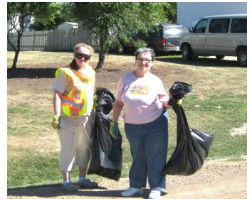
Volunteers help clean up Portage!

2011 was another great year for the PCRC. Over 200 people came out to help us clean up our neighbourhoods over the summer! Added to that was the work of our two summer students and the Aggassiz Youth groups and together we cleaned up 95% of Portage la Prairie. Over 100 bags of trash taken off our streets!