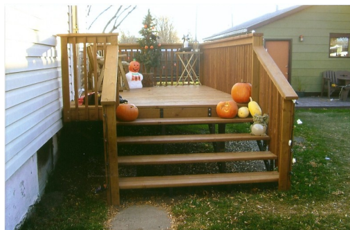
After Homeowner Small Grant—stairs were removed and a deck built