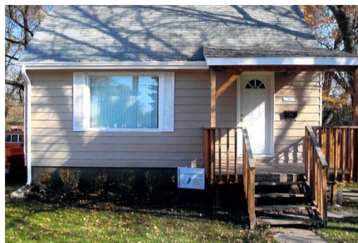
Before and After Home Beautification 2010