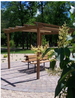
Sunset Palliative Care received $6,000 towards the Memory Garden in the Park